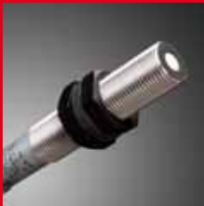
Sensor technology – Compact intelligence