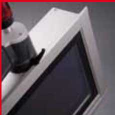
Enclosure technology – Function and design