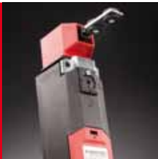
Switch technology – Economy meets safety